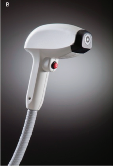
Figure 1. The Accent unipolar (A) and bipolar (B) handpieces.